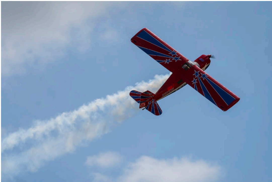
Photo of a giant scale Decathalon taken at the “Fall Big Bird festival” in Texas